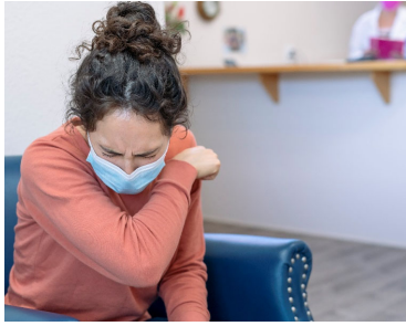
A patient has a high fever, cough and sore throat