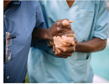
A patient feels faint and cannot walk without assistance