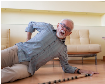
A patient falls and injures their back